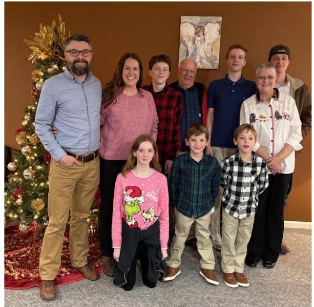
Brown/Gifford Family Christmas 2024