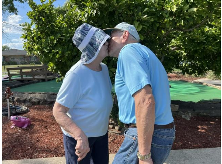
Get a hole-in-one, get a kiss!